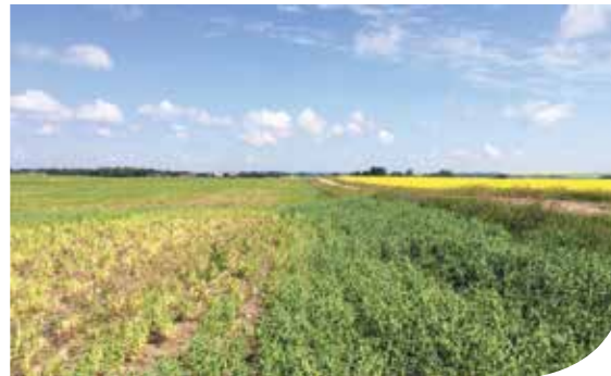
Better peas along field edge where grass helps reduce excess water