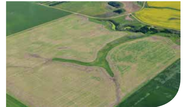
Aerial shows entire pea field in Alberta affected by root rot