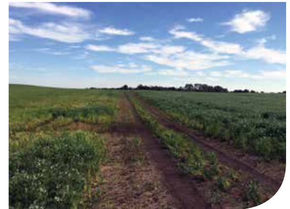
Root rot identified in left field in 2014. Field on the left had peas in 2010. The field on the right had canola in 2010, with no peas for previous eight years

The root rot pathogen can infect various crops in the rotation, or survive as a saprophyte (feeding on dead plant material) until the next susceptible crop is grown, and/or conditions are favourable for disease.