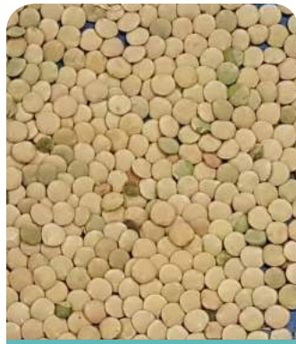
30% Moisture Content

Seed quality is reduced if plants are terminated early (prior to physiological maturity), as illustrated by poor seed quality in photo on left (terminated at 50% moisture content).