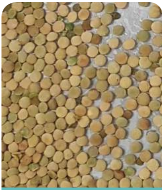
50% Moisture Content