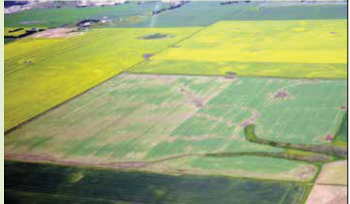
ABOVE: A pea field infected with Aphanomyces root rot near Drumheller, AB. The importance of crop rotation is shown by the clear division down the centre of the field. Prior to being farmed as one field, the more diseased half on the left had been in pea production longer than the healthier half on the right.