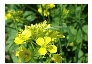
Figure 11. Lacewing adult in canola.