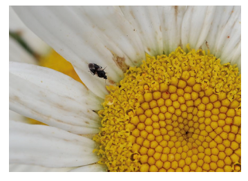
Figure 15. Minute pirate bug. Adults are 2 to 5 mm long with an X pattern on their backs, and feed on all stages of aphids as well as other small insects. Source: Jennifer Bogdan

Figure 14. Syrphid fly (hoverfly) adult. Adults are important pollinators and feed on nectar, pollen, and aphid honeydew (liquid waste excreted from the aphid digestive system). Source: Jennifer Bogdan