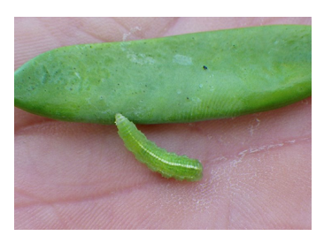
Figure 13. Syrphid fly (hoverfly) larvae