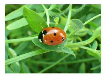
Figure 9. Seven-spotted ladybeetle adult in lentils.