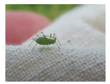
Figure 4. Wingless pea aphid.

Pea aphids overwinter as eggs on perennial legumes such as alfalfa and clover. When plant growth resumes in the spring, the eggs hatch into small, wingless female nymphs. Once full-grown, these females, called stem mothers, can reproduce without mating and will give live-birth to the next all-female aphid generation. In the second and third generations, both winged and wingless aphids are produced and the winged aphids can migrate into other host crops such as peas and lentils. These winged aphids feed, then produce a generation of wingless females, which in turn produce a generation of wingles females. Whenever a host crop becomes less suitable for aphid development, such as when the crop is cut or begins to senesce, the winged males and wingless females. They mate and the females lay eggs on the leaves and stems of perennial legumes. The eggs can withstand the low temperatures that kill nymphs and adults.