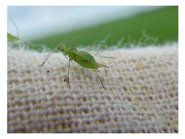
Figure 3. Winged pea aphid.