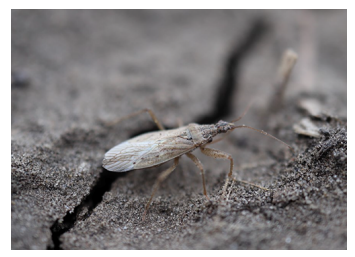
Figure 16. Adult damsel bug. Adults and nymphs are fast, aggressive predators that inject a toxic saliva into their prey that both paralyzes the prey and digests its body contents into a fluid that is then sucked up by the damsel bug.