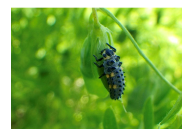
Figure 10. Ladybeetle larva in lentils.