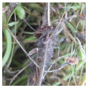
Grey mould on stem