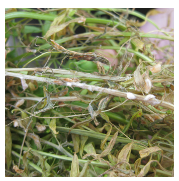
White mould on stem