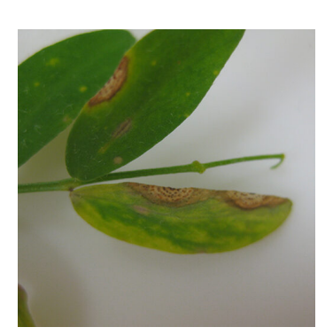
Leaf lesion