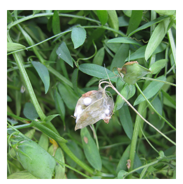
White mould on pods