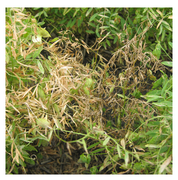
Late Symptoms