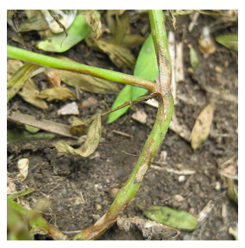
Stem lesion