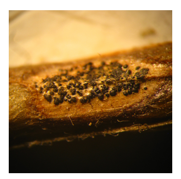
Close-up of microsclerotia