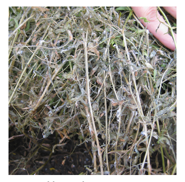
Grey mould on pods