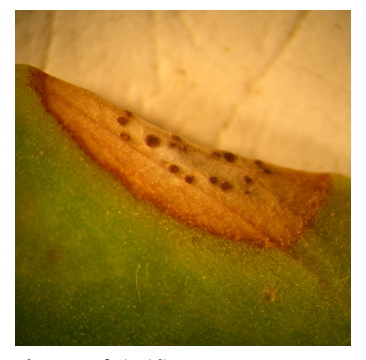
Close-up of picnidia