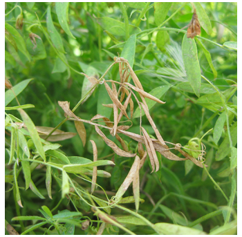
Early Symptoms