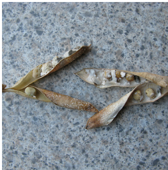
White mould pod infection