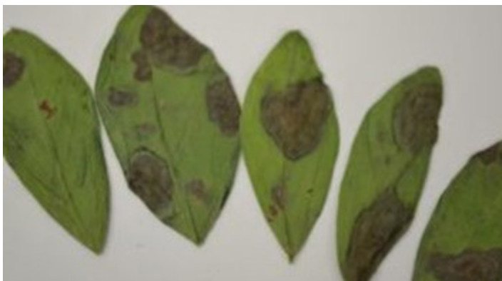
Figure 8: Stemphylium blight in faba beans, characterized by dark grey/black lesions.