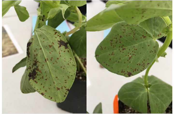
Figures 3 & 4: Early stages of chocolate spot symptoms in faba beans

Farmers should take care to scout their fields prior to flowering to determine the economic viability of fungicide application for chocolate spot control. If the specific planting location is known to have chocolate spot in the past, fungicides may be applied at flowering. However, depending on the environmental conditions and timing of infection, a fungicide application may not be economical since the effects of the disease are highly dependent on the infection level. According to the 2023 Saskatchewan Guide to Crop Protection , some foliar-applied fungicides registered for controlling chocolate spot in faba beans include Priaxor® and Vertisan®. Be sure to always follow product labels for application directions.