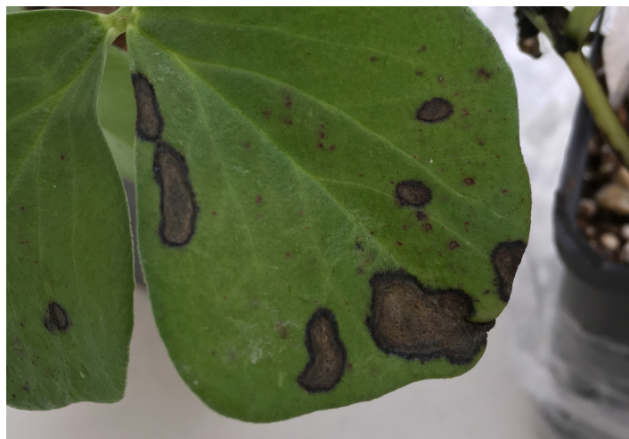
Figure 10: Ascochyta blight is identifiable by grey or tan lesions with dark fruiting bodies (pycnidia) in the centre.

In terms of disease management, following best management practices is always encouraged. Early crop harvest, meaning early spring seeding, may help protect seed quality from late-season effects of Ascochyta blight. Cultural control methods, such as ensuring reasonable seeding rates to manage canopy density, will help to mitigate disease. If fungicides are used, they should be applied at the first sign of disease. Currently, it is not common to spray for Ascochyta blight in faba beans in Western Canada. However, according to the 2023 Saskatchewan Guide to Crop Protection , there are many foliar fungicide options registered for the control of Ascochyta blight in faba beans including Miravis® Neo 300SE, Priaxor®, Proline Gold®, and Vertisan®, among others.