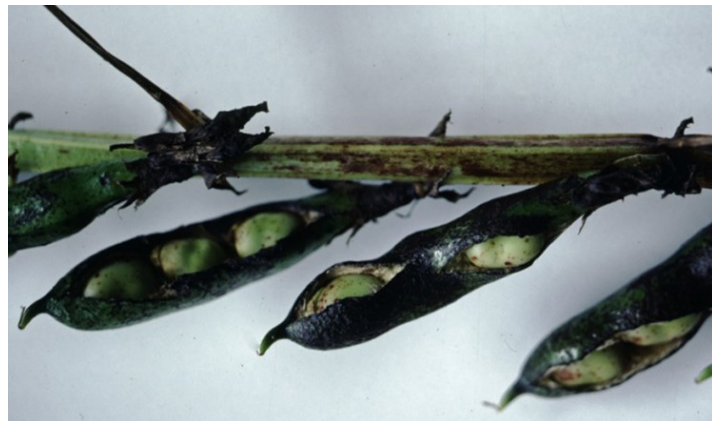
Figure 5: Late-stage chocolate spot infection on a faba bean pod; note the split pods and discolored seeds