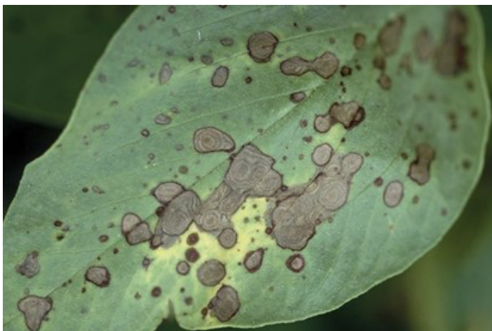
Figure 13: Alternaria disease can be identified by small to medium circular lesions or necrotic areas on plant leaves, with concentric rings inside the lesions.

When managing for Alternaria, growers need to consider non-chemical options. There are currently no fungicides registered in Saskatchewan to control Alternaria leaf spot on faba beans. Maintaining crop canopies at less-dense levels can mitigate Alternaria infections by keeping humidity low. Due to the limited economic risk associated with Alternaria leaf spot in faba beans, specific management for this disease is often not required.