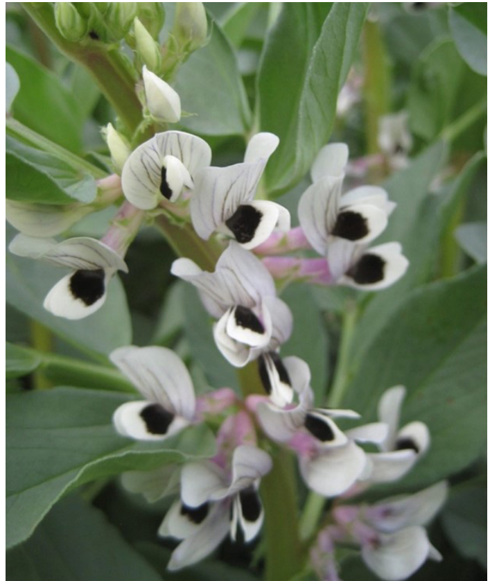
Figure 1: Faba bean plants with melanin flowers on tall, hollow stems.

Like other legume crops, faba beans are particularly susceptible to a range of foliar diseases including chocolate spot, Stemphylium blight, Ascochyta blight, and Alternaria . These diseases can pose serious challenges for producers in the Prairies and can have a detrimental impact on bean quality and yield. Often, differentiating foliar diseases is a challenge in faba beans. The following outlines the traits of each disease, how they may impact faba bean crops in the Prairies, and management practices that Saskatchewan producers can implement to help combat these diseases on their own operations.