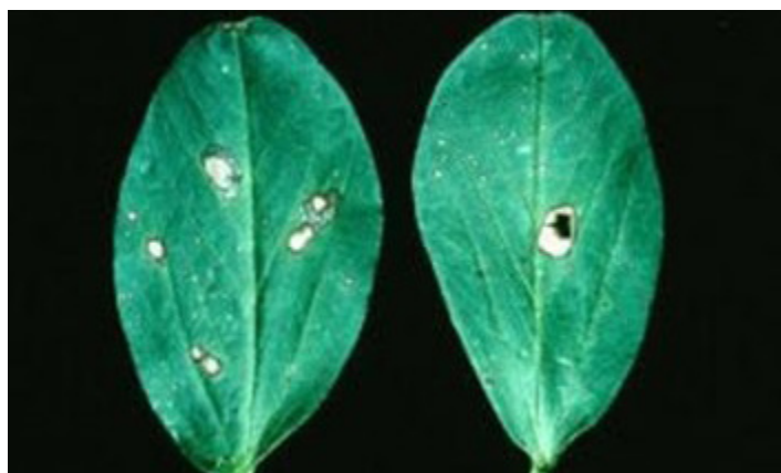
Figure 11: Oftentimes, the centers of the Ascochyta lesions will fall out of the plant leaf, leaving behind a "shot hole" pattern.