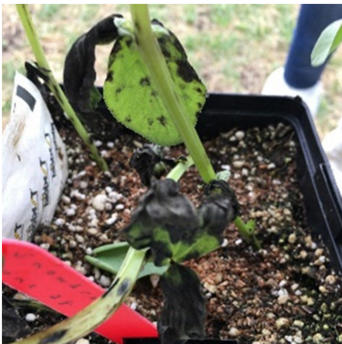
Figure 9: Later stage Stemphylium blight symptoms in a faba bean plant. Note the leaf necrosis.