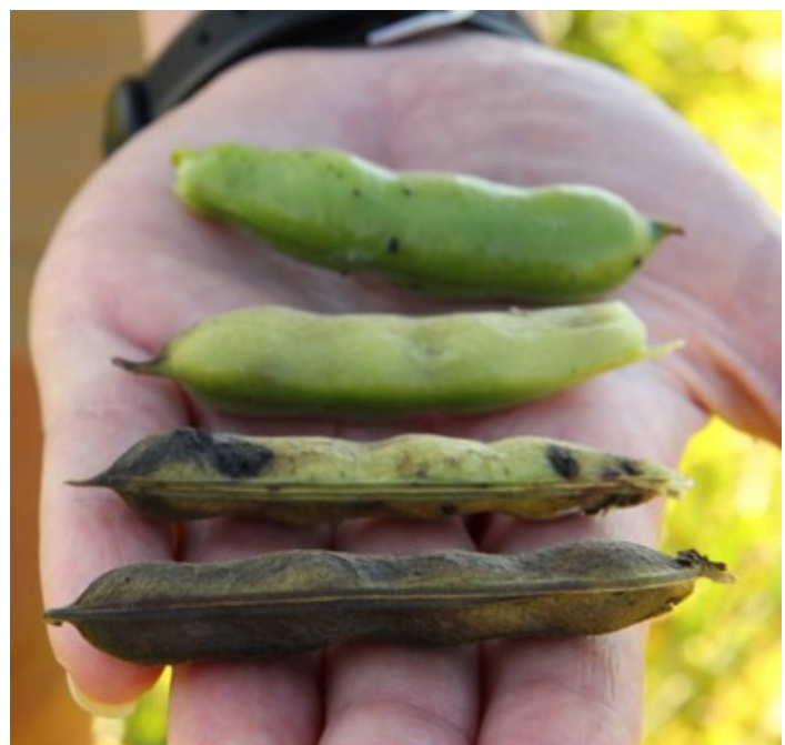
Figure 2: Desiccation progression on a selection of faba beans; note the large pod size.