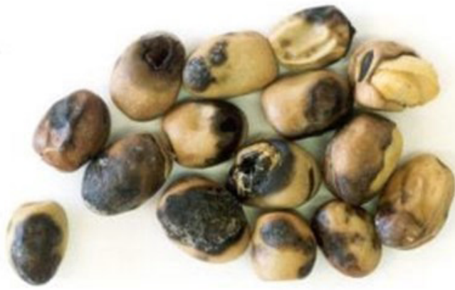
Figure 12: Faba bean seeds can become shriveled and discolored because of Ascochyta infection. In severe cases, the seeds can become unsaleable.