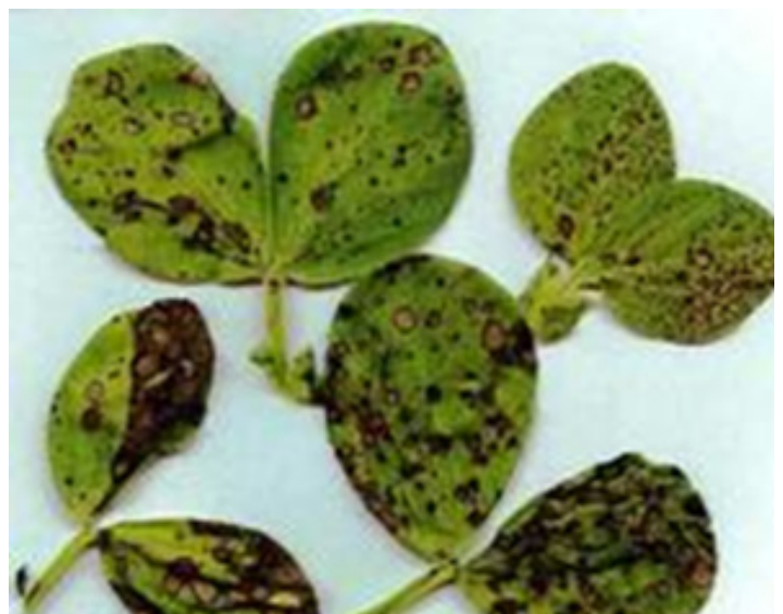
Figure 6: Symptoms of chocolate spot on faba bean leaves in the later stages of infection; note the enlarged necrotic sections